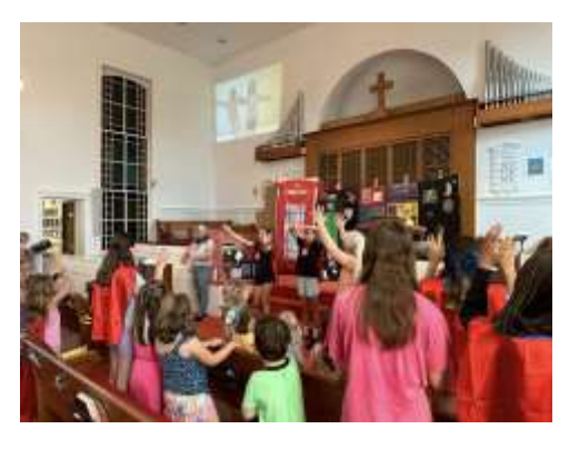
Web: www.alexpres.org https://www.facebook.com/alexpres.org/