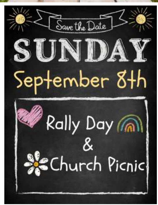
141 Little York-Mount Pleasant Road Milford, NJ 08848