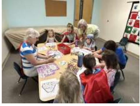
Some of our wonderful volunteers and helpers!