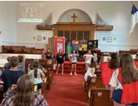
2024 Vacation Bible School at AFPC was super-hero-tastic!!!!